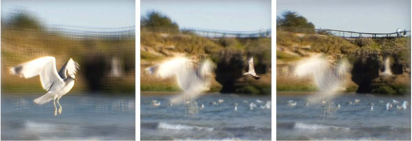
Figure 1: Seagulls in flight captured with our light field camera. We demonstrate refocusing on different depths after the picture has been taken. With conventional cameras the photographer has no time to focus on different objects of interest in a dynamic scene. (For view interpolated version that eliminates the artifacts of this example see Figure 6.)