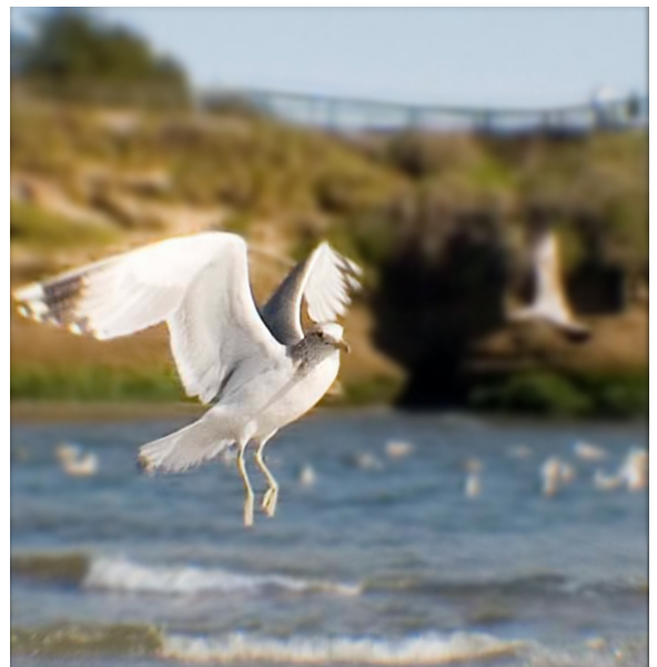
Figure 6: The seagull of Figure 1 after view interpolation to generate a dense light field and remove sampling artifacts.